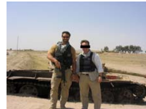
C4i Security Director & US Defense executive, Iraq

OVER THE PAST SEVERAL YEARS PROTECTING OUR WAY OF LIFE, AND THE LIVES OF OTHERS, HAS EVOLVED INTO A NEW GLOBAL MIND-SET AND COMMITMENT. PROTECTING ASSETS, BOTH HUMAN AND PHYSICAL PROPERTY, HAS ALSO BECOME A CORPORATE WAY OF LIFE.